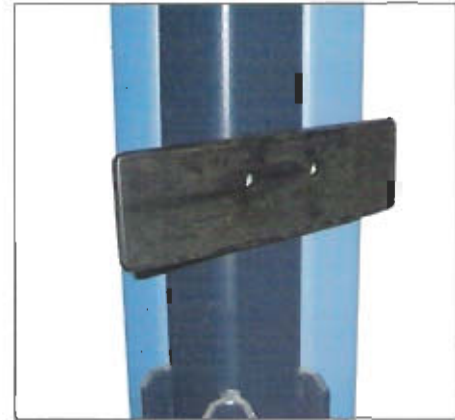
Large door stops make sure car door finish will not be damaged